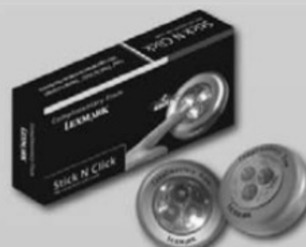
The Anywhere LED Light