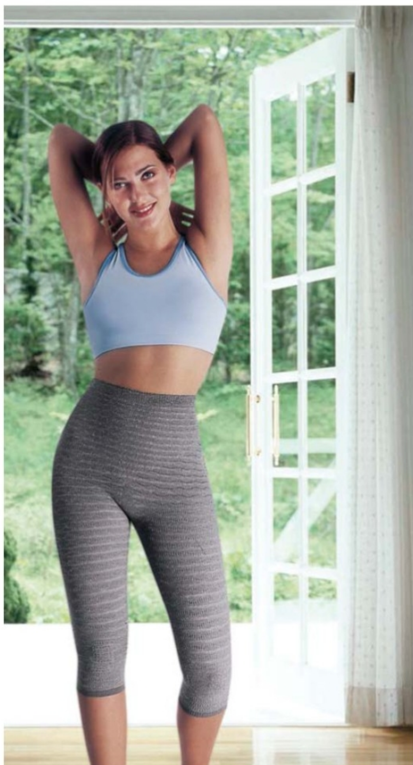
The Texenergy Bodysuit for shaping tummy and thighs. — TEXENERGY

□ Individuals or distributors who are interested to know more about Texenergy products can contact PanMedic Sdn Bhd at Tel: (03) 7981 0970, fax: (03) 7981 9359 or e-mail: ymt@panmedic.com