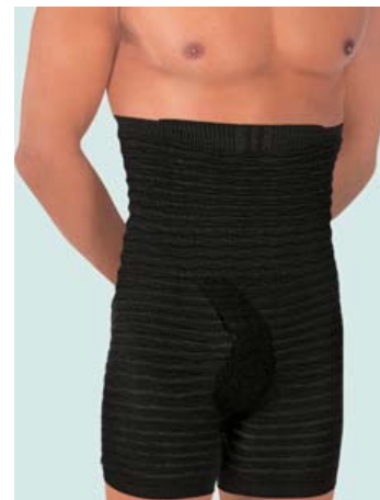
The version for men.

The Texenergy Bodysuit is said to reduce cellulite and shape the tummy and thighs.