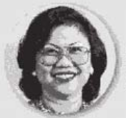
Official Opening & Keynote Address by YB Dato' Seri Rafidah Aziz, Minister of International Trade and Industry