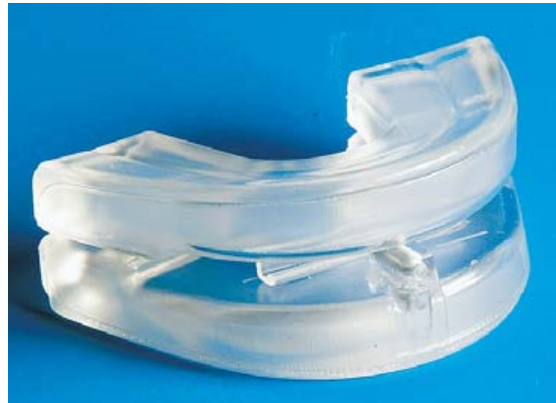
The Somnoguard, which looks like a pair of dentures, allows the respiratory tract to open up further.

The Somnoguard is made from a flexible material and resembles dentures. It can be fitted by the user himself or a dentist.