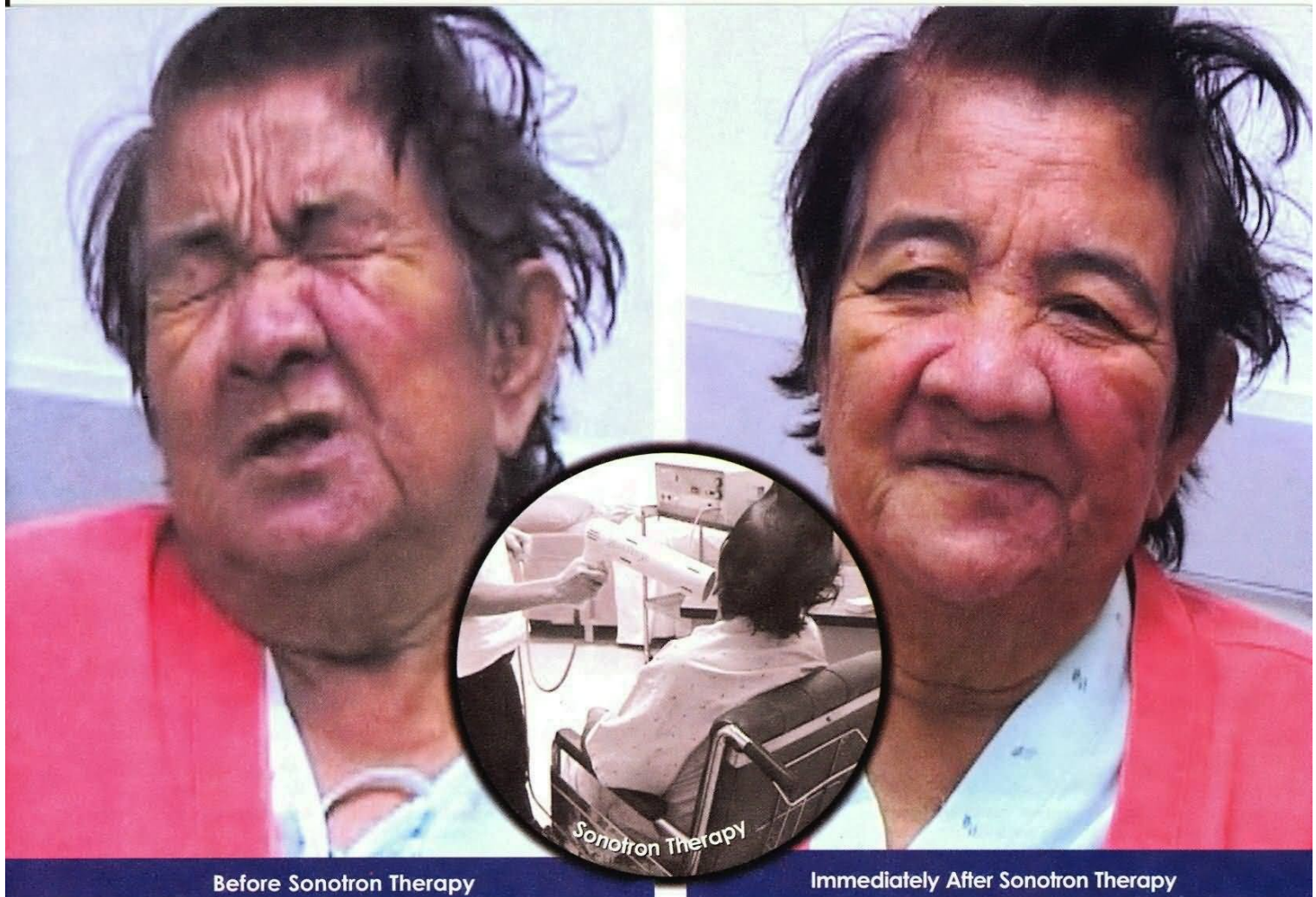
Before Sonotron Therapy

The patient is having extreme pain from an attack of postherpetic neuralgia. Her pain specialist has already put her on the highest dose of Gabapentin.