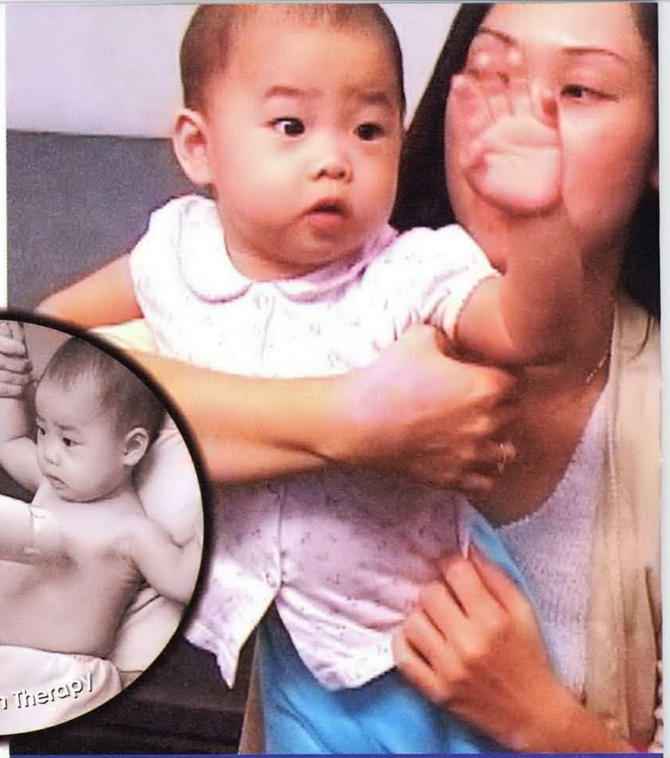
On the 2nd day

The tired baby, 10 months old, has been not sleeping well for about 2 weeks because of persistent cough. She was treated by a child specialist but without much relief.