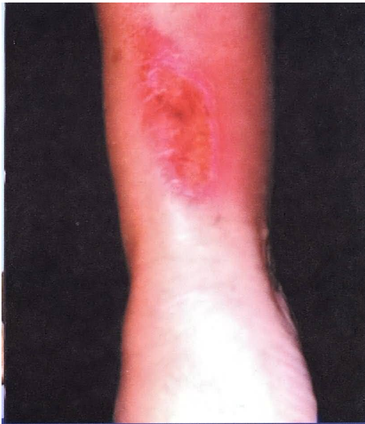
Before Sonotron Therapy

A part of the lower arm of an elderly lady was burnt accidentally by a hot iron.