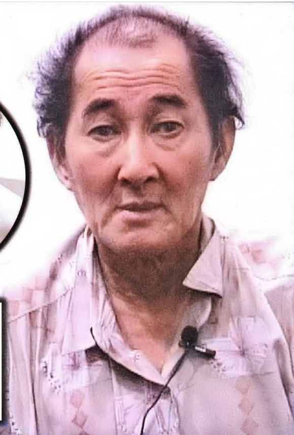
Immediately after Sonotron Therapy

Immediately after Sonotron Therapy, he is able to lift up his head and inhale deeply without coughing. He is also able to talk without difficulty.