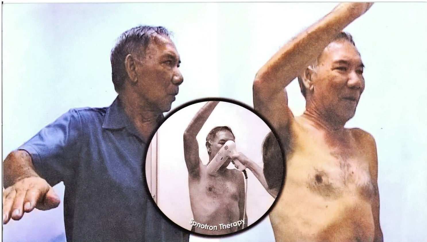
Before Sonotron Therapy

The patient has chronic pain at his right shoulder when moving his arm. He cannot lift his right hand above his head.