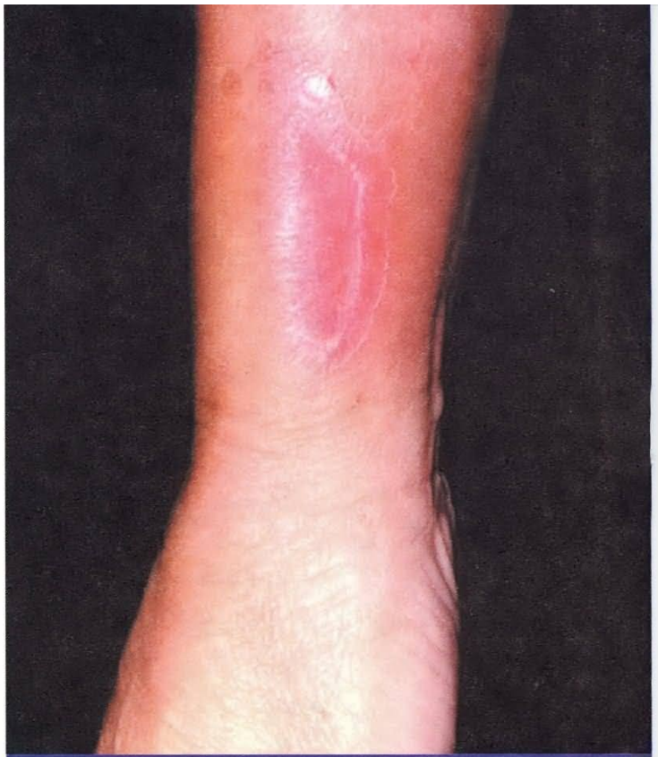
After 3 treatment sessions

A part of the lower arm of an elderly lady was burnt accidentally by a hot iron.