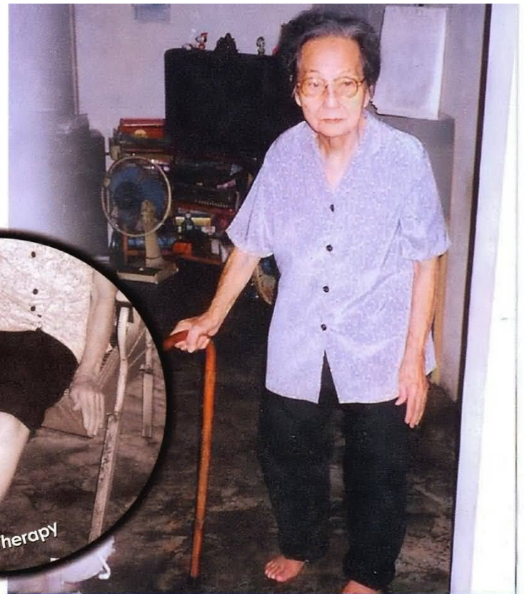
After 6 Sonotron Therapy sessions

After 6 Sonotron Therapy sessions, the old lady is able to walk by herself with the support of a cane. She looks good.