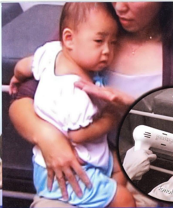
Before Sonotron Therapy

The tired baby, 10 months old, has been not sleeping well for about 2 weeks because of persistent cough. She was treated by a child specialist but without much relief.